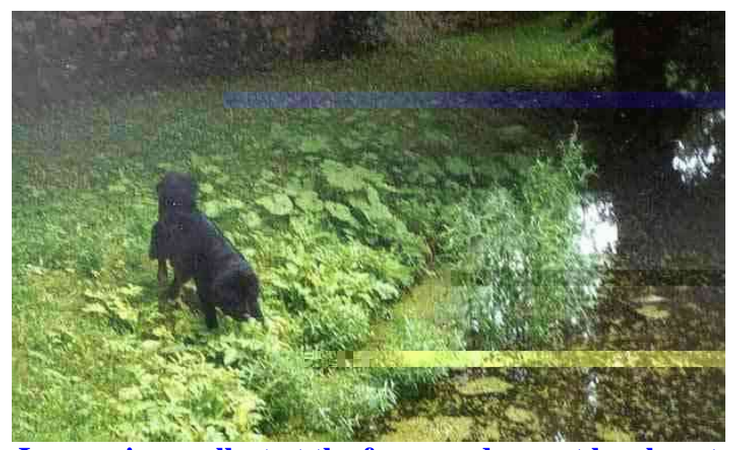
artist he are. In almost all Impressions collect at the frog pond - must be almost actions it is calmly thought over each particular - need time!

Even this characteristic is laid out here to country often as distrust or as uncertainty, was however in the country of origin with fulfilling its functions survive necessary. What uses the best dog if it with the meeting with new one, unknown quantities equal comes around the life?