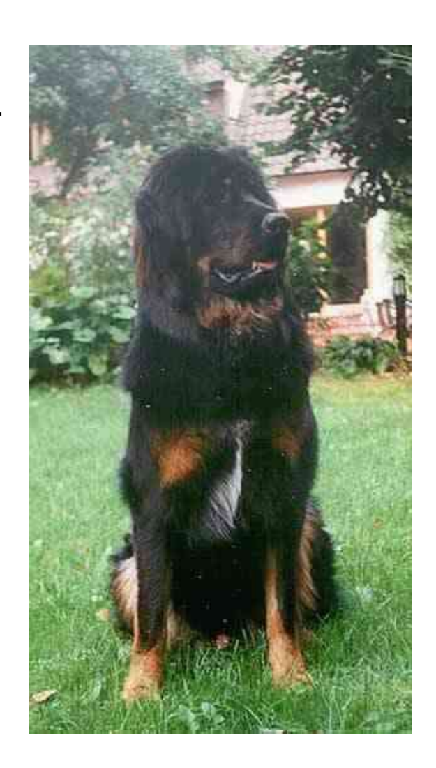
A Do Khyi, here Maxe of 8 Mon. is always a guard

Usually were sufficient one to three Do Khyi for these functions completely. Holding of large packs of dogs was just as not possible in this surrounding field not usually, and thus was also not exchangeable good dogs. A good dog was valuable and possessed high reputation, protected it with the cattle the base of life, as well as the possession of its owner nevertheless.